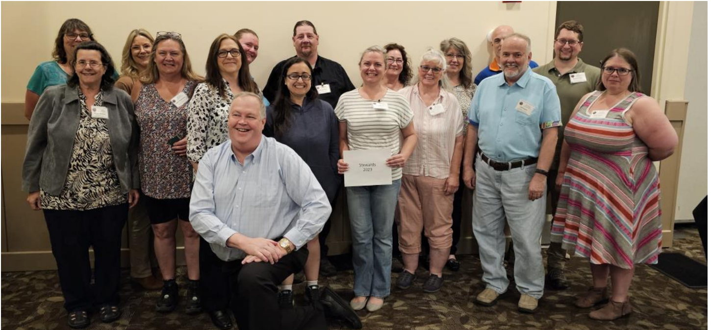
WARLCA stewards at State Convention, June 2023.

Constitution amendments shall become effective upon adjournment of the State Convention unless otherwise stipulated and can only be amended by submitting the amendment in writing at a State Convention and shall require a two-thirds vote to amend.