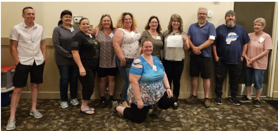
Convention first timers