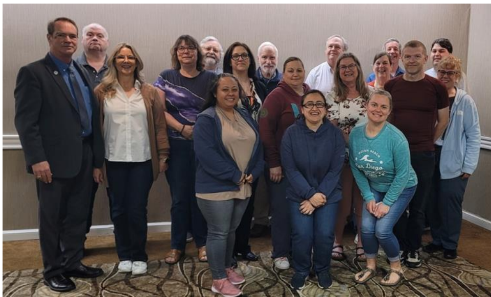
Washington rural carriers at the 2023 Western States Conference held in San Diego CA in April 2023.